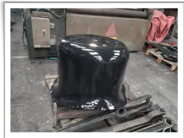
Top: A view of the right hand side of the tender in grey primer.